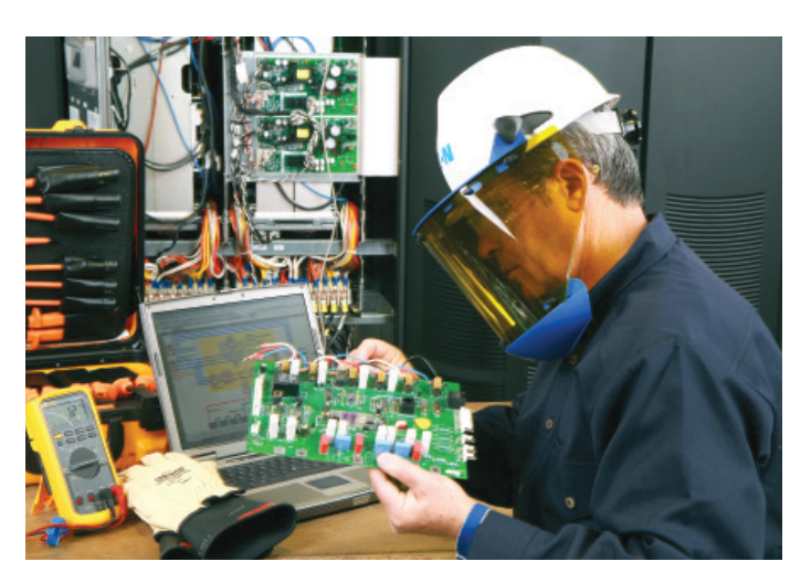
The 93PM warranty and service protection plan provides an onsite 24x7 startup service, coverage and 8-hour response along with complimentary operator training.

Each Eaton® 93PM UPS includes a comprehensive one-year onsite support plan. The warranty and service protection plan provides an onsite 24x7 startup service with a full year of parts and labor, 24x7 onsite coverage and 8-hour response (U.S. only) along with complimentary operator training. In addition to this first year support, the 93PM UPS comes standard with one year of Eaton's PredictPulse™ remote monitoring service and a PowerXpert connectivity kit (upon enrollment) to deliver 24x7 monitoring from Eaton analysts and expedited response to critical alarms.